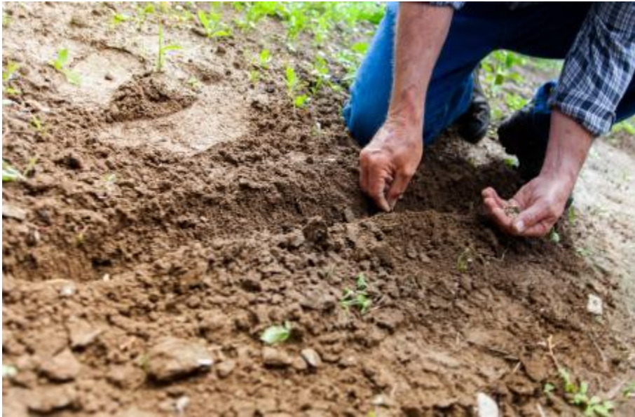
Farmer & Community Education